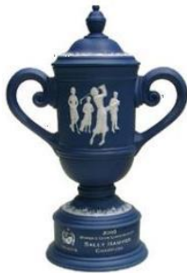
The Kilbey Cup

Friday August 11 th ..... EGC Club C Weekend Social August 12 th & 13 th .....2023 EGC Club Championship August 30 th ..... No Wednesday League September 3 rd ..... EGC 2-Person Family Event September 4 th ..... Labour Day Holiday September 6 th ..... Wednesday League Final September 12 th ..... Women's League Banquet September 13 th ..... EGC Member Guest September 17 th ..... The Kilbey Cup Invitational September 30 th ..... Two-person Tombstone